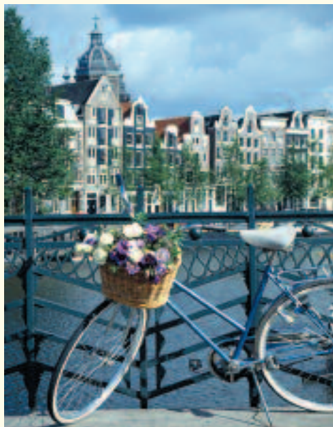
Stroll through delightful Amsterdam, city of canals, flowers and charming merchant houses.

Before embarking the M.V. HEIDELBERG, join us on this exclusive optional two-night stay in Amsterdam featuring accommodations in the first-class Crowne Plaza Amsterdam , a landmark property located in the heart of the city. Visit Amsterdam's most important monuments on a specially arranged walking tour through Old Town, including the Dam Square and the Royal Palace. During a tour of the Rijksmuseum, home to one of the finest collections of art in the world, witness the genius of the great Dutch Masters. Complete details will be provided with your reservation confirmation.