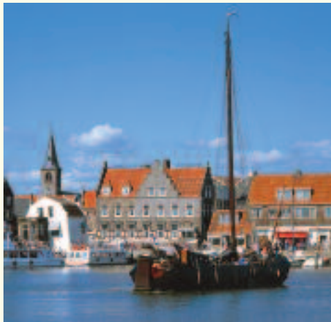
Learn about life in a traditional Dutch fishing village during a visit to the charming port of Volendam.

bridges, slides and storm-surge barriers was built after the catastrophic floods of 1953 to protect southwestern Holland from the encroaching North Sea.