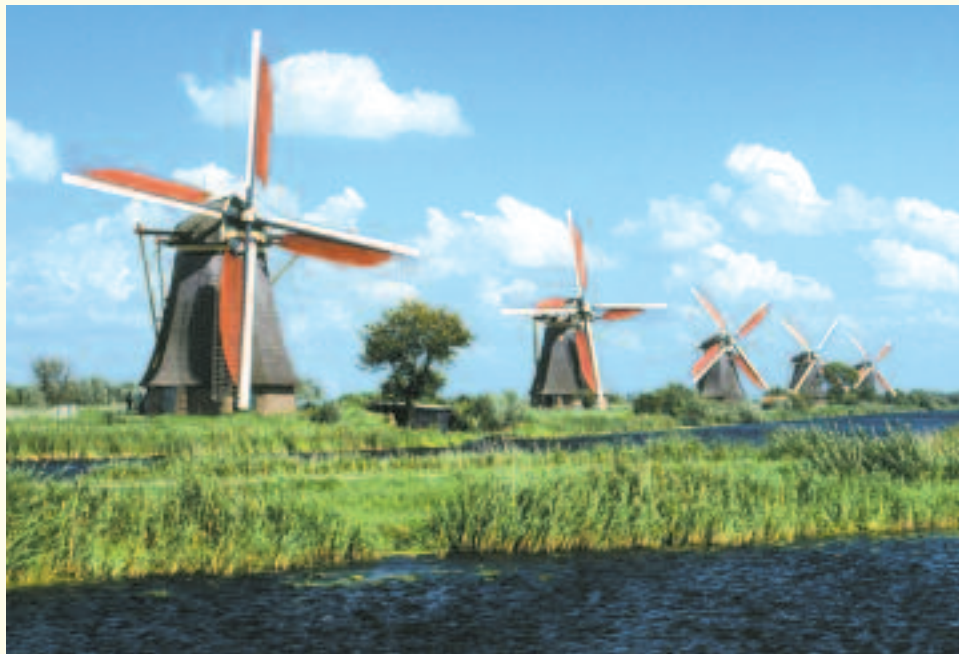
Kinderdijk's authentic 18th-century windmills evoke Holland's old world ambiance and are perfect examples of innovative Dutch engineering.

Unpack once! This exceptional travel opportunity includes all accommodations, meals and exclusively arranged excursions for an incredibly attractive price. Come experience a special way of life: RIVER LIFE ALONG THE WATERWAYS OF HOLLAND AND BELGIUM.