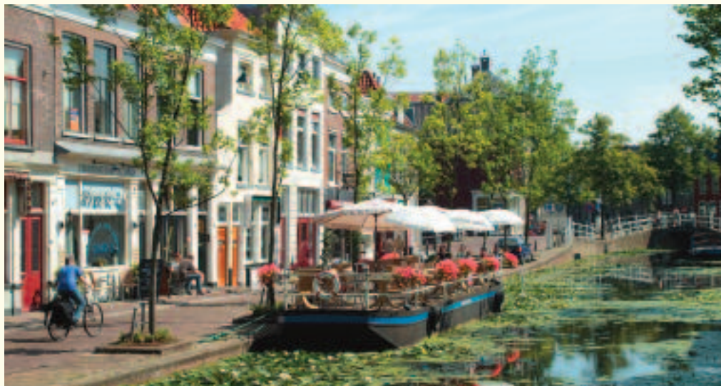
Canals, like this tree-lined canal in Delft, have played an integral role in the daily life of The Netherlands' residents for hundreds of years.

Just to the northeast of Middelburg stands one of the most impressive feats of hydraulic engineering in the world, Holland's famous Delta Works. Developed over the past 50 years, this vast and complex system of locks, sluices, channels,