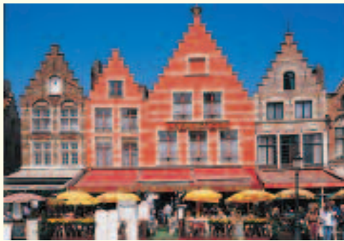
Bruges' 16th-century merchant houses symbolize its status as a prosperous medieval center of commerce.