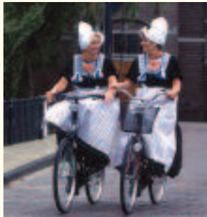
See the traditional dress of The Netherlands in Volendam.

The M.V. HEIDELBERG has been specially selected for this travel program as it features deluxe accommodations, superior service and skillfully prepared regional and international cuisine.