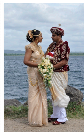
A marriage ritual