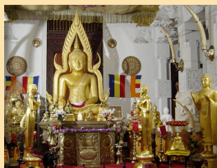
Temple of the Tooth, Kandy (with an inside view)