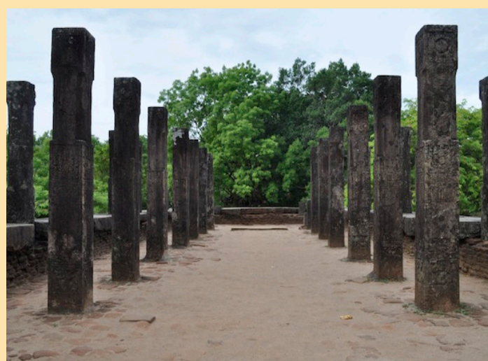
Majestic pillars of Polonnaruwa