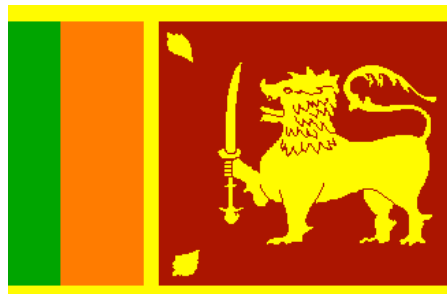
National Flag of Sri Lanka

People of Sri Lanka always believed in simple livelihood. Festivals coincided with the collecting of the harvest, and the important events in the Buddhist calendar. Pageantry cannot be kept apart from the cultural traditions of Sri Lanka. The most renowned event globally is the "Kandy Perehera", the religious-festive procession held in Kandy in July/August each year, in honor of the Tooth Relic of the Buddha. It is known as a festival of sight and sound. Sri Lanka is basically an agriculture based society.