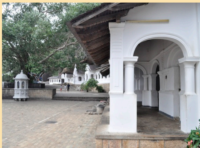
Dambulla Cave Temple