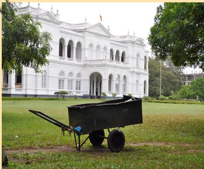
Colombo National Museum

Leave for Anuradhapura, stopping at Yapahuwa, to see the spectacular granite stairway to the summit. Yapahuwa was the capital of Sri Lanka in the latter part of the 13th century (1273-1284). Built on a huge, 295ft high rock the carved stone balustrades, and friezes embellishing the remains of the palace and fortress are interesting examples of the art of the period.