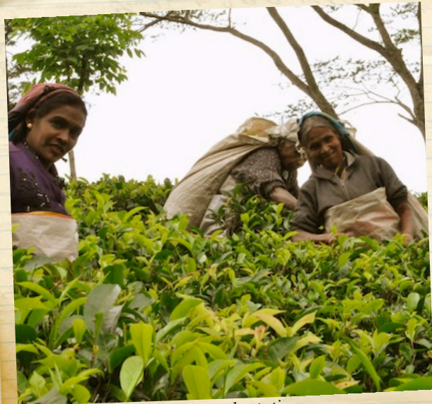
At the tea plantation