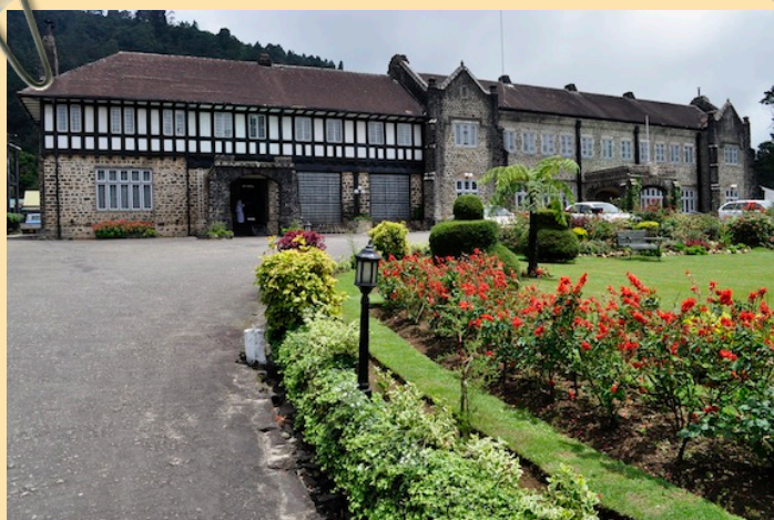
Hill Club, Nuwara Eliya

Early morning transfer to international airport to catch your flight home.