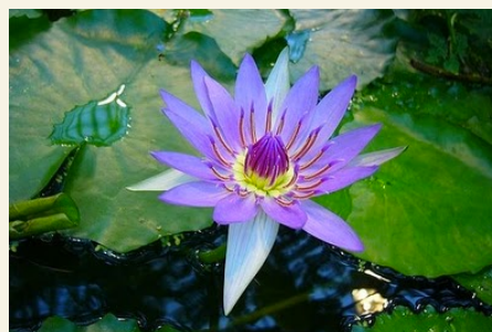
Blue Water Lilly - National Flower