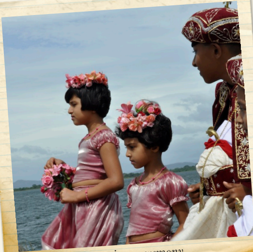
A marriage ceremony