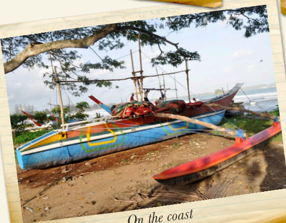
On the coast