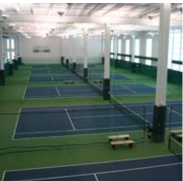
Life Time Fitness