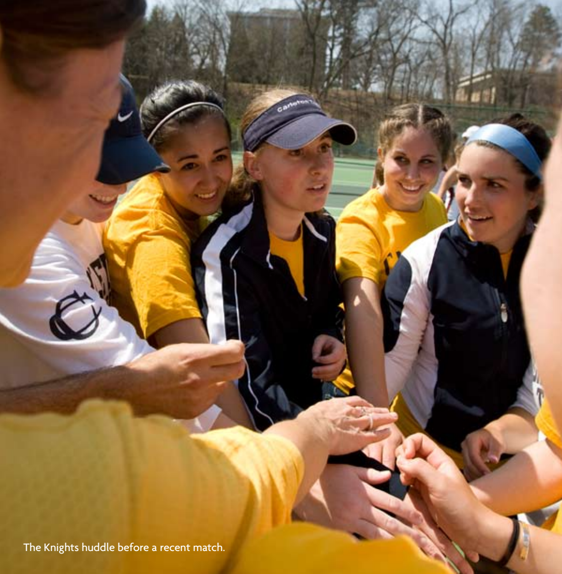
The Knights huddle before a recent match.

C arleton's women's tennis program enjoys a pattern of success on the court, while maintaining the needed balance for student-athletes to be successful in a rigorous academic setting. The Knights participate in the Minnesota Intercollegiate Athletic Conference (MIAC), which consists of 13 NCAA Division III private institutions. Competition is strong, with several teams consistently earning regional and national rankings. Carleton regularly finishes in the MIAC top three and has gone to the NCAA Championships three times in the history of the program.