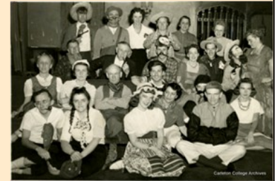
1941 Halloween at Faculty Club

Bobbing for apples is thought to have originated from the roman harvest festival that honors Pamaona, the goddess of fruit trees.