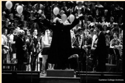
1997 Death Conducts the Orchestra, Midnight Halloween Concert

Hold on, man. We don't go anywhere with "scary," "spooky," "haunted," or "forbidden" in the title. ~ From Scooby-Doo