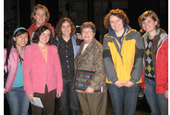
Students with theologian Elizabeth Johnson, (center).

Elizabeth Johnson. In the lecture entitled "Seeking the Living God: Nourishing Faith with the Living Tradition," Johnson discussed the role of the Nicene Creed in the lives of modern Christians. □