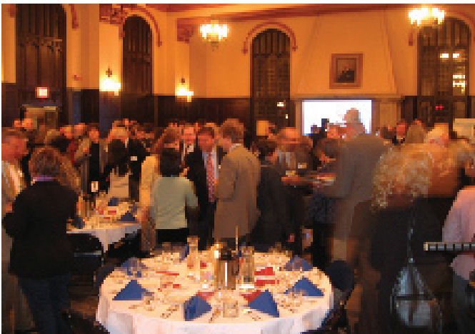
50TH ANNIVERSARY GALA DINNER AND PROGRAM