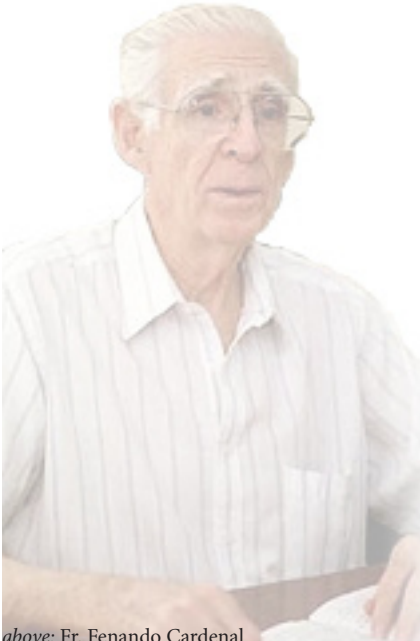
above: Fr. Fernando Cardenal