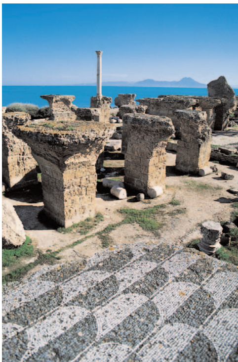
The magnificent view from the ruins of ancient Carthage

Set on a spacious bay on Corsica's southeast coast, charming Porto-Vecchio was the Portus Syracusanus mentioned by Ptolemy. Disembark in the morning and drive along the island's east shore to Aleria, the site of ancient Alalia, founded by Greeks in 565 B.C., later taken over by the Carthaginians and Romans, who made it the capital of