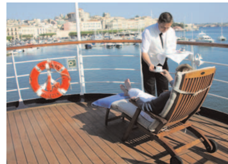
Relaxing on Corinthian II's Sun Deck