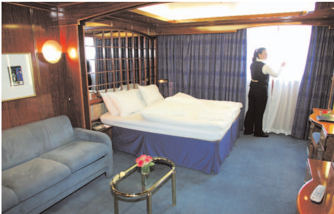
Category B Suite