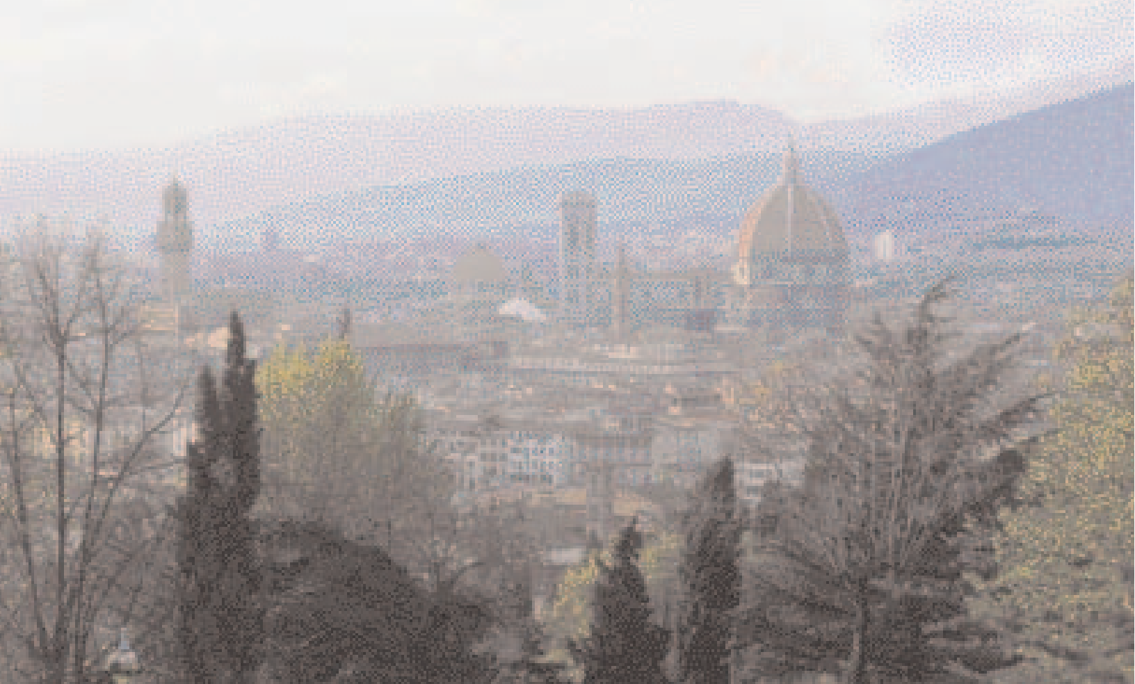
Florence, Italy, cradle of the Renaissance