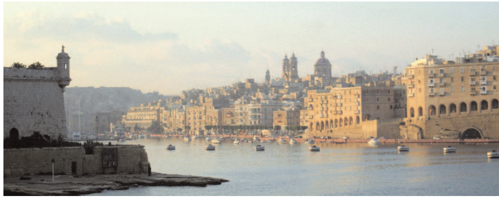
The historic harbor of Valletta, Malta

Corsica. Explore the ruins, mostly from the Roman period, set beautifully on a plateau, just above the sea. After lunch aboard, spend the afternoon in Bonifacio, one of the most striking towns in the Mediterranean, set high on a limestone promontory facing a fjord. Considered by many to be the Homeric site of the Laestrygonians, Bonifacio's old houses are set on stepped and narrow alleyways. (B, L, D)