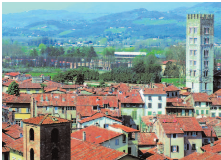
"Everything in Lucca is good," wrote Hillaire Belloc.